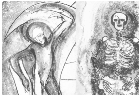
from Soul Cards

Gaia wondered, "What is this that this child reacts so? This one bears watching."